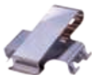
Belt clip (x1) Part No.: 4123 6463 30