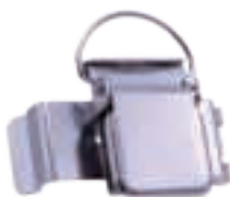
Alligator clip Part No.: 4711 7111 10