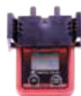
Heat-resistant case *1 Part No.: 4732 5029 70