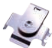
Helmet mounting clip *2 Part No.: 4732 4978 10