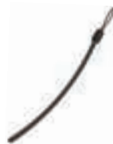
Hand strap Part No.: 0888 0605 90