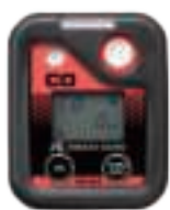
Protection cover (x1) Part No.: 4123 6450 20