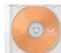
Data logger management program Part No.: 9811 0940 20